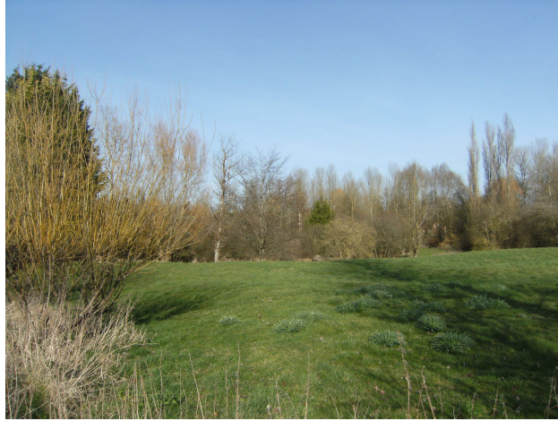
Linear mound in bailey field. The ground falls away to a small lake to the north and thence to the River Wylye.