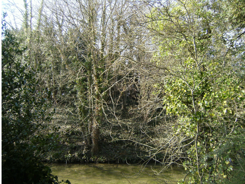
The motte at Sherrington

The motte stands to the west of the church, partly hidden by trees and surrounded by a moat, which always contains water, being fed from the springs arising in the nearby hills. The underlying rock is chalk, but the settlement is based on river gravels (Crowley, 1995:235).