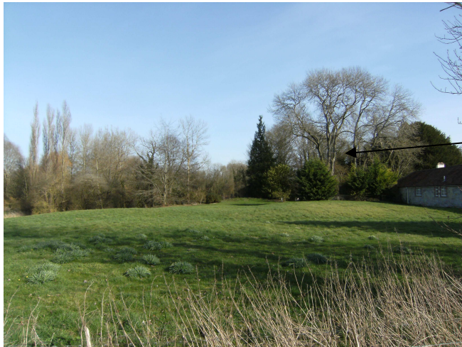
View from the west of the bailey field, looking east towards the motte. Arrow indicates the position of the motte.

Earthworks in the field to the west of the motte have been interpreted as the bailey. These were discovered during drainage operations, where a low linear mound and an accompanying shallow depression were thought to be the northern arm of the bailey defences. They were sectioned and a substantial ditch, 251 wide was revealed. Tip lines were visible to a depth of 5', but no dating evidence was found (County Field Archaeology Officer, 1973: 137-8).