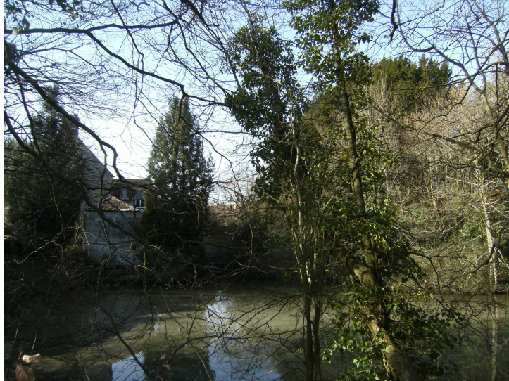
The moat on the south and east side of the motte, which is to the right

Earthworks in the field to the west of the motte have been interpreted as the bailey. These were discovered during drainage operations, where a low linear mound and an accompanying shallow depression were thought to be the northern arm of the bailey defences. They were sectioned and a substantial ditch, 251 wide was revealed. Tip lines were visible to a depth of 5', but no dating evidence was found (County Field Archaeology Officer, 1973: 137-8).